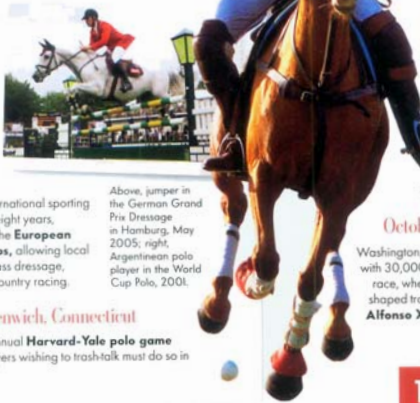
Above, jumper in the German Grand Prix Dressage in Hamburg, May 2005; right, Argentine polo player in the World Cup Polo, 2001.

London may have just nabbed the 2012 Olympic bid, but the British horse set has the jump on hosting an international sporting crowd. For the first time in eight years, England will preside over the European Eventing Championships , allowing local nabobs to take in world-class dressage, show jumping, and cross-country racing.