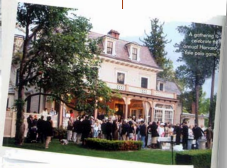
A gathering to celebrate the annual Harvard-Yale polo game.

Argentina's most famous exports (those rash heartrob polo players) take time off from the paycheck polo circuit to return to the motherland and trounce one another in the sport's premier annual competition: the Argentine Polo Championship . (No licat patrons are allowed to muck up the game; this is for real players only.)