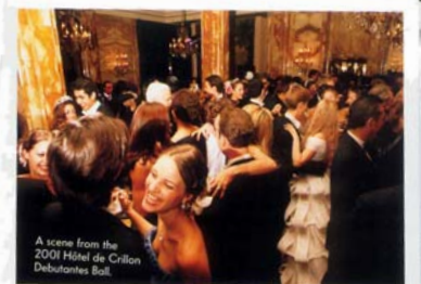
A scene from the 2001 Hôtel de Crillon Debutantes Ball.